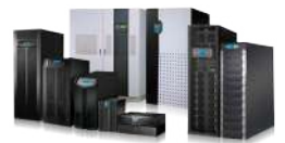
Delta offers a full range of UPS solutions from 600 VA to 4000 kVA to fulfill your power security needs.