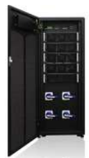
Highly integrated with four built-in switches