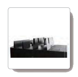
Roof Cable Ports & Covers